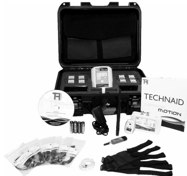
Tech-MCS V3: Big case for up to 16 Tech-IMUs *

* The images are indicative, may change according to the required configuration for each customer.