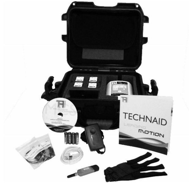
Tech-MCS V3: Medium case for up to 8 Tech-IMUs *